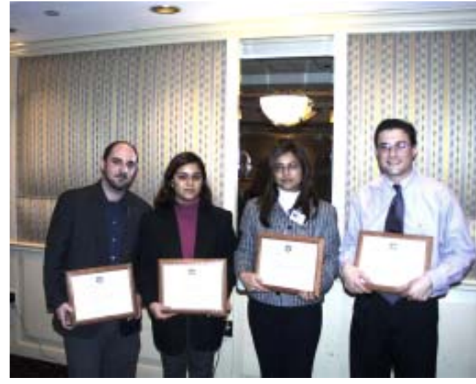
MCDS welcomes our newest members