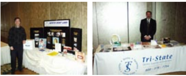
Asteto Dental Labs and Tri-State Dental Supplies and Equipment support our General Meeting. Please patronize them before and after the meeting!

What Happens if the Unthinkable Occurs? Is your office Ready? Get Prepared Today! B&S CPR Instruction